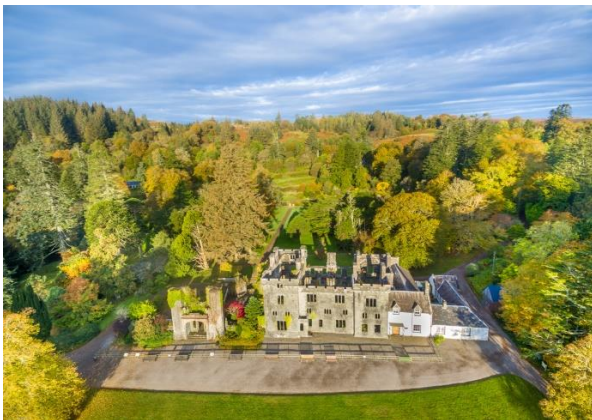
Woodland gardens at Armadale Castle