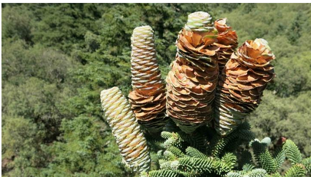
Abies pinsapo var. marocana