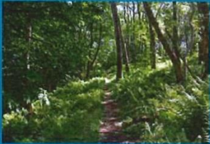
Explore our woodlands