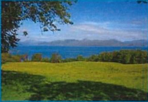
View from Red Trail